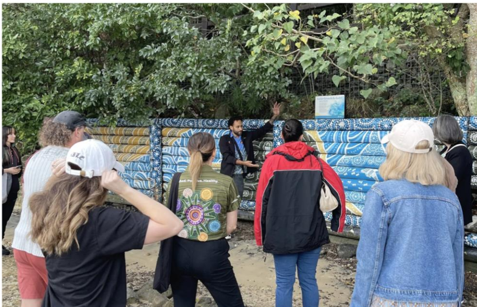
Walkers on Country in awareness of First Nations, users of knowledge, stories and history.