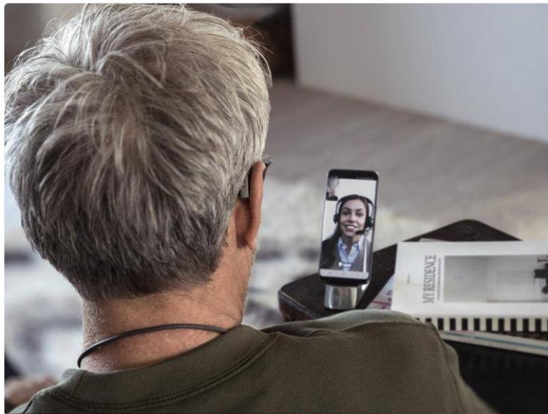
Doctors want the government to reinstate Medicare items for long telephone consultations