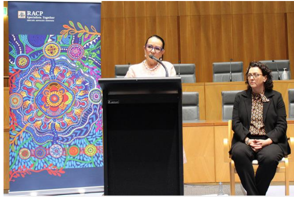
The Hon. Linda Burney MP (left), Minister for Indigenous Affairs, addresses the RACP Parliamentary Child Health Roundtable, with by Dr Monique Ryan (right), MP FRACP.