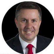
THE HON MARK BUTLER MP Australian Minister for Health and Aged Care

WITH AUSTRALIAN HEALTH MINISTER MARK BUTLER