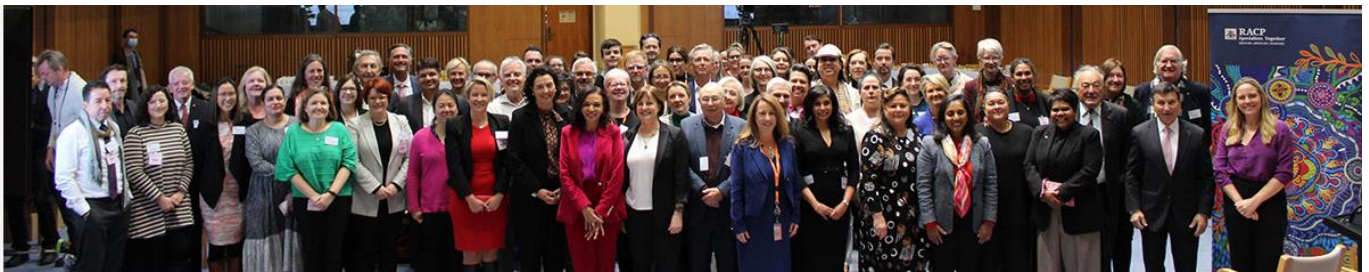
The RACP 2023 Parliamentary Child Health Roundtable was well attended by Members of Parliament and RACP members.