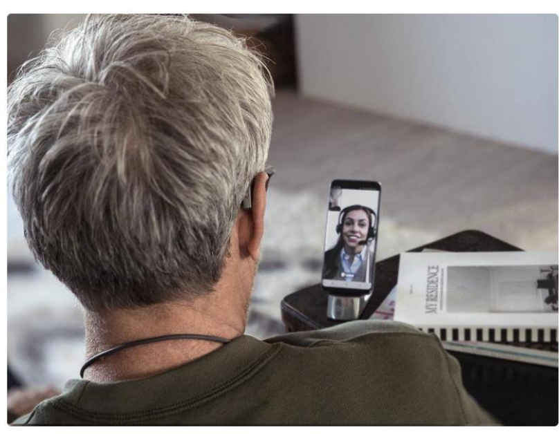
Doctors want the government to reinstate Medicare items for long telephone consultations