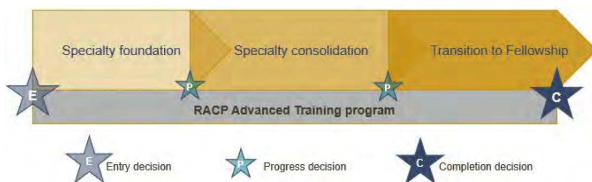
Figure 1: Advanced Training learning, teaching, and assessment structure