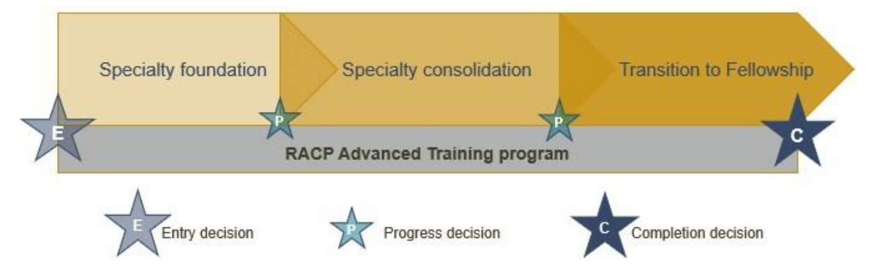
Figure: Advanced Training learning, teaching, and assessment structure