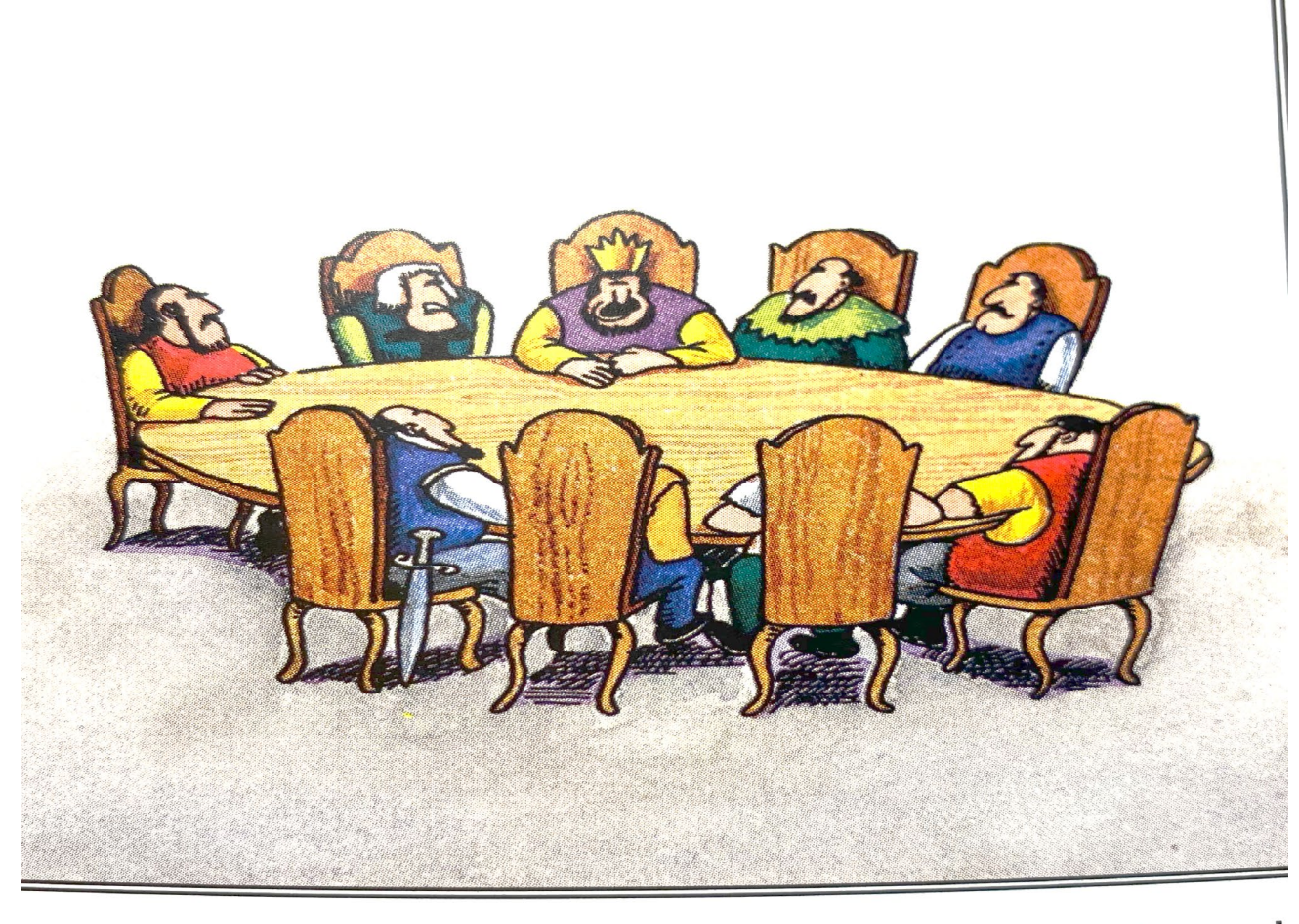
"And that goes for Lancelot, Galahad, and the rest of you guys—no more stickin' your gum under the table."