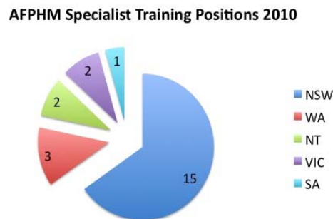
Figure 2: The location across Australia of AFPHM training positions funded through the DoHA STP